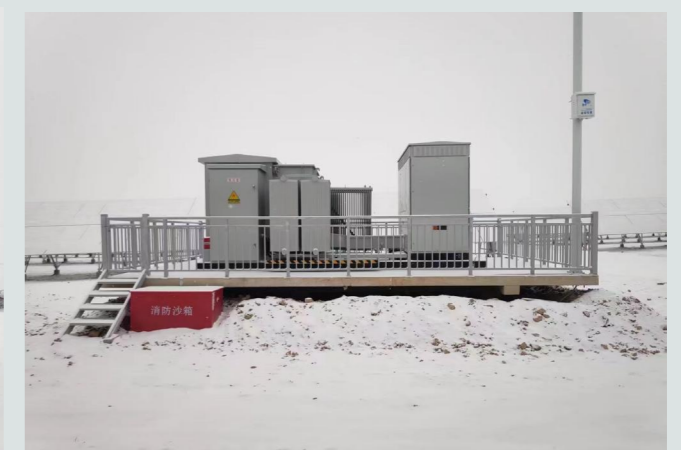
Providing photovoltaic substations to support the progress of energy transformation projects in Inner Mongolia.