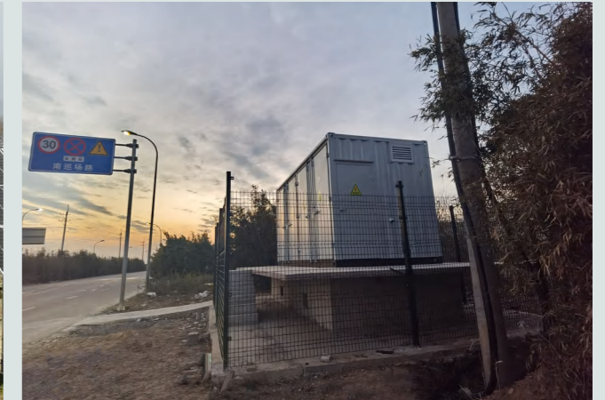
Participating in the substation supply and use of the photovoltaic cluster project in central Myanmar.