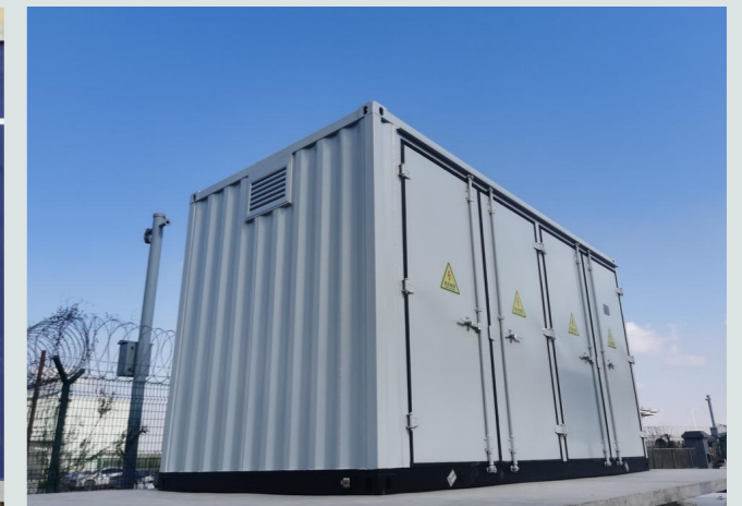
Participating in the substation supply and use of the photovoltaic cluster project in central Myanmar.